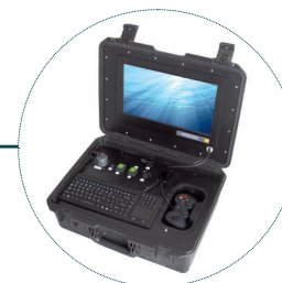
Surface Control Unit

TMI-Orion S.A. Parc Bellegarde - Bâtiment A 1, chemin de Borie 34170 Castelnau-le-Lez - France T.: +33 (0)4 99 52 67 10 – F.: +33 (0)4 99 52 67 19